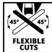
45° 45° FLEXIBLE CUTS